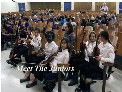
Meet The Juniors

In the fall of 2018 we will be launching an El Sistema program at Locke Public School to serve the children of North East St. Thomas. There is tremendous enthusiasm in this lovely "South London" community and we have already received sizable donations to make this expansion possible.