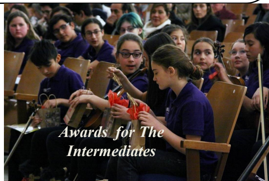
Awards for The Intermediates